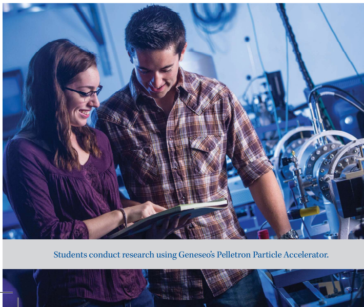
Students conduct research using Geneseo's Pelletron Particle Accelerator.

46% of graduating seniors undertook a research project