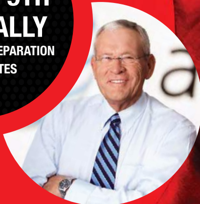
Edward E. Whitacre Jr. Former Chairman & CEO of AT&T Former Chairman & CEO of General Motors

RANKED 9TH NATIONALLY IN WORKFORCE PREPARATION OF GRADUATES