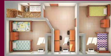
Beddow, Calkins, Emmons, Herrig, Larzelere, Merrill, Saxe, Sweeney, Thorpe, Trout and Woldt halls