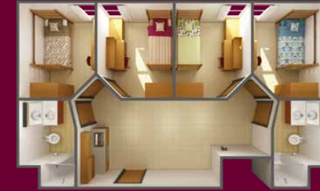
Campbell, Celani, Fabiano, Kessler and Kulhavi halls - Reserved for returning and transfer students