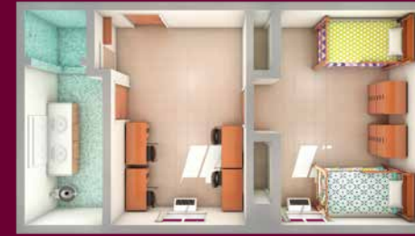
Carey, Cobb, Troutman and Wheeler halls

» We offer four room options ranging from 1-4 occupants.