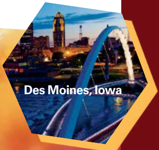
Des Moines, Iowa

Iowa State has been voted one of the nation's safest campuses.